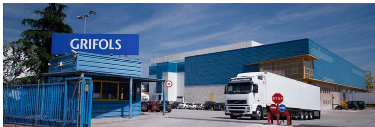
Grifols New Logistics Headquarters in Parets del Vallès, Barcelona

At 66.4 million Euros, net income was down 18.7% as a result of higher financial expenses.