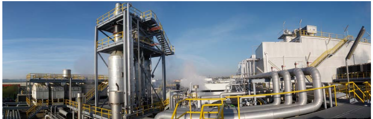
Detail of the cogeneration plant in Parets del Vallès, Barcelona

The Bioscience Division's facilities in Parets del Vallès (Barcelona) are subject to the European Union Greenhouse gas Emissions Trading Scheme. Emissions in the first half of 2010 were 12,000 tons of CO 2 , 10% less than the emission rights assigned by the Spanish Government for this period. This reduction was achieved thanks to the optimal functioning of the new cogeneration plant which obtains 15% in Primary Energy Savings (PES).