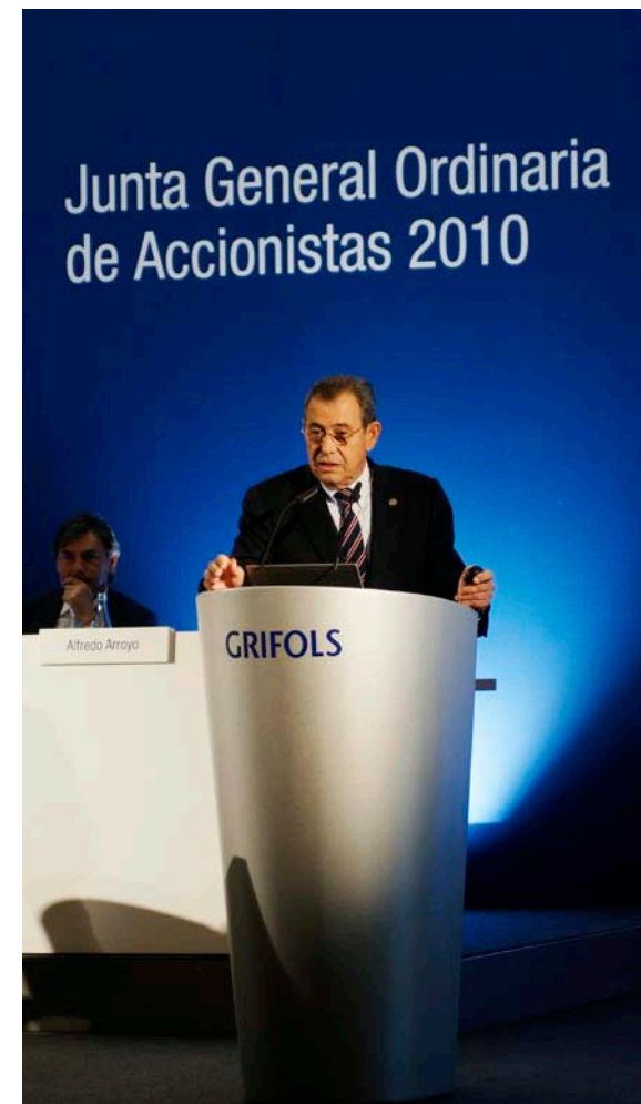
The President, Victor Grifols during his intervention.

Grifols' average workforce at 30 June 2010 was 5,881 employees, 1.7% fewer professionals than at year-end 2009. This reduction is the result of the optimisation of human resources required at the plasma donation sites in the United States.